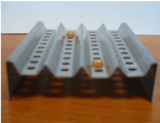
Box interior with 40 positions