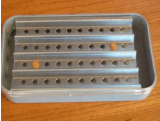
Box for storage and manipulation of TO-5 packages